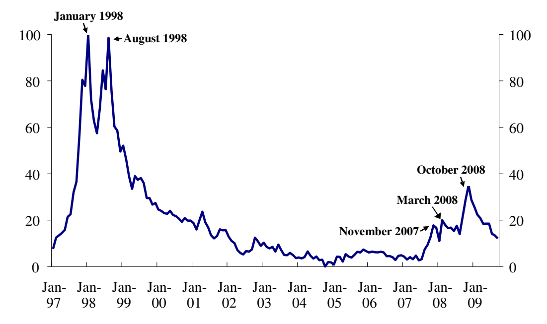
Figure 1: Composite financial stress index

An objective of the use of an FSI is to allow policymakers and market practitioners to track the development of stress in a financial system. One simple way to examine the ability of the index in capturing financial distress is to study the evolution of the indexes during the historical periods. In this section, we evaluate the dynamics of the composite FSI and the four sub-FSIs to identify episodes of financial stress graphically and discuss the evolution of financial stress in Hong Kong from January 1997 to September 2009.