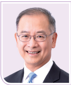
Mr Eddie YUE , JP The Monetary Authority