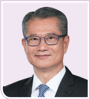
The Honourable Paul CHAN Mo-po , GBM, GBS, MH, JP The Financial Secretary