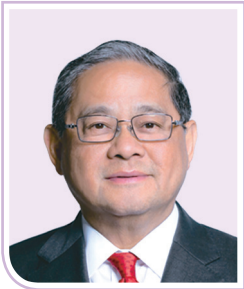
Dr the Honourable Victor FUNG Kwok-king , GBM, GBS Chairman Fung Investments