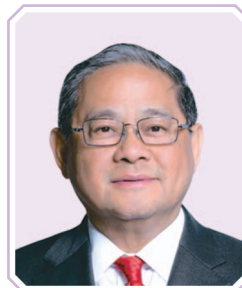
Dr the Honourable Victor FUNG Kwok-king, GBM, GBS