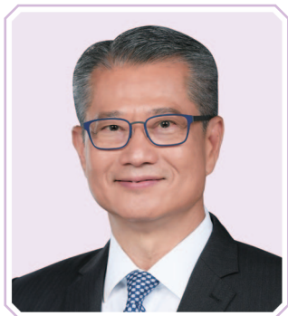
The Honourable Paul CHAN Mo-po , GBM, GBS, MH, JP The Financial Secretary