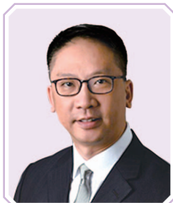
The Honourable Rimsky YUEN Kwok-keung, GBM, SC, JP

Chairman Hysan Development Company Limited (until 30 April 2024)