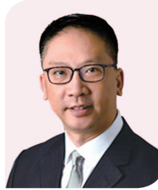
The Honourable Rimsky YUEN Kwok-keung , GBM, SC, JP Temple Chambers