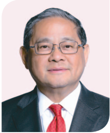
Dr the Honourable Victor FUNG Kwok-king , GBM, GBS Chairman Fung Group