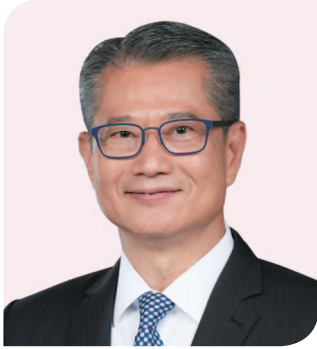
The Honourable Paul CHAN Mo-po , GBM, GBS, MH, JP The Financial Secretary