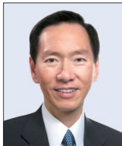
The Honourable Bernard Charnwut CHAN , GBM, GBS, JP President Asia Financial Holdings Limited