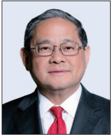
Dr the Honourable Victor FUNG Kwok-king , GBM, GBS Chairman Fung Group (from 29 October 2021)