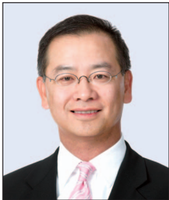
Mr Eddie YUE , JP The Monetary Authority