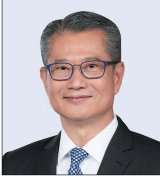
The Honourable Paul CHAN Mo-po , GBM, GBS, MH, JP The Financial Secretary