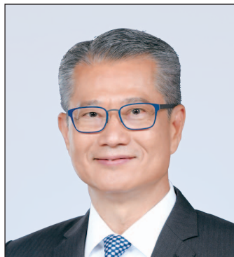
The Honourable Paul CHAN Mo-po , GBM, GBS, MH, JP The Financial Secretary