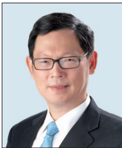
Mr Norman T.L. CHAN , GBS, JP The Monetary Authority