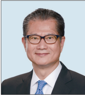
The Honourable Paul CHAN Mo-po , GBM, GBS, MH, JP The Financial Secretary