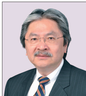
The Honourable John TSANG Chun-wah , GBM, JP The Financial Secretary (until 15 January 2017)