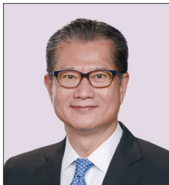
The Honourable Paul CHAN Mo-po , GBM, GBS, MH, JP The Financial Secretary (from 16 January 2017)