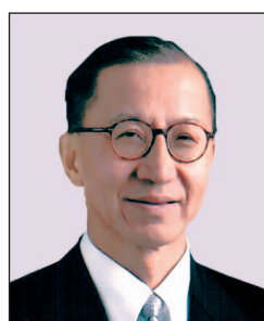
Dr LO Ka-shui, GBS, JP Chairman and Managing Director Great Eagle Holdings Limited (until 31 January 2018)