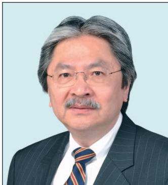
The Honourable John TSANG Chun-wah , GBM, JP The Financial Secretary