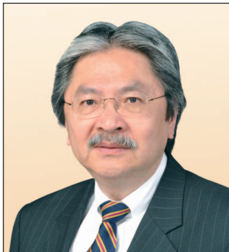
The Honourable John TSANG Chun-wah , GBM, JP The Financial Secretary