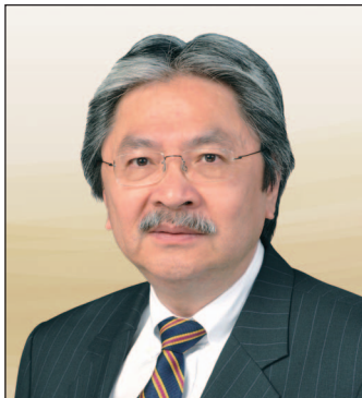
The Honourable John TSANG Chun-wah , GBM, JP The Financial Secretary