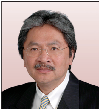
The Honourable John TSANG Chun-wah , GBM, JP The Financial Secretary