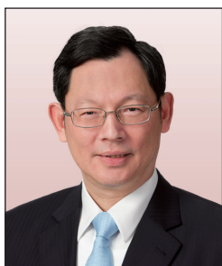
Mr Norman T.L. CHAN , SBS, JP The Monetary Authority