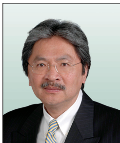
The Honourable John TSANG Chun-wah , GBM, JP The Financial Secretary