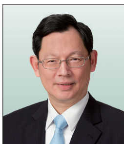
Mr Norman T.L. CHAN , SBS, JP The Monetary Authority