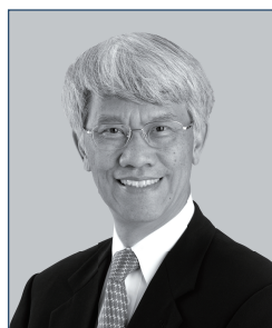
The Honourable Joseph YAM, GBM, GBS, JP The Monetary Authority (until 30 September 2009)