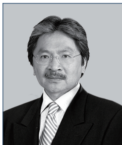
The Honourable John TSANG Chun-wah, JP The Financial Secretary