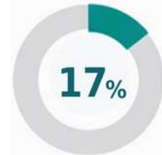
Share of OTCC's total margin collateral

Bond Connect bonds have become an important source of margin collateral at OTCC.