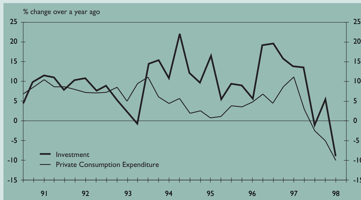
Chart 2 Private Consumption Expenditure and Investment