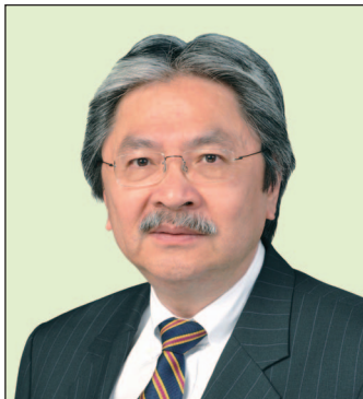
The Honourable John TSANG Chun-wah , GBM, JP The Financial Secretary