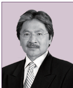
The Hon. John TSANG Chun-wah, JP The Financial Secretary