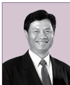
Dr the Hon. Marvin CHEUNG Kin-tung , DBA Hon., GBS, JP (until 30 September 2008)