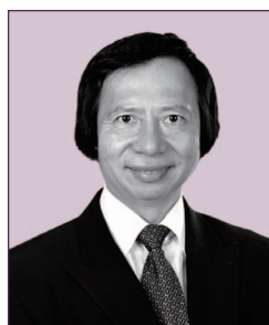
Mr Thomas KWOK Ping-kwong, SBS, JP Vice Chairman and Managing Director Sun Hung Kai Properties Limited